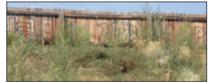
Hillside overlooking Cherry Knolls Park, showing weeds, graffiti and dilapidated fence