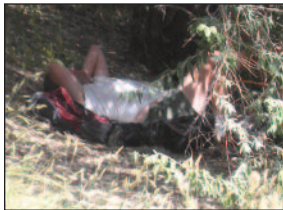
A homeless man takes up long term residence on the hillside by Cherry Knolls Park