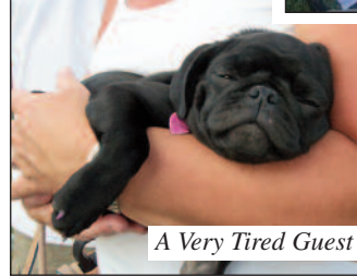
A Very Tired Guest