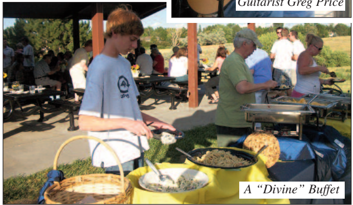
A "Divine" Buffet