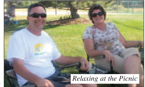
Relaxing at the Picnic