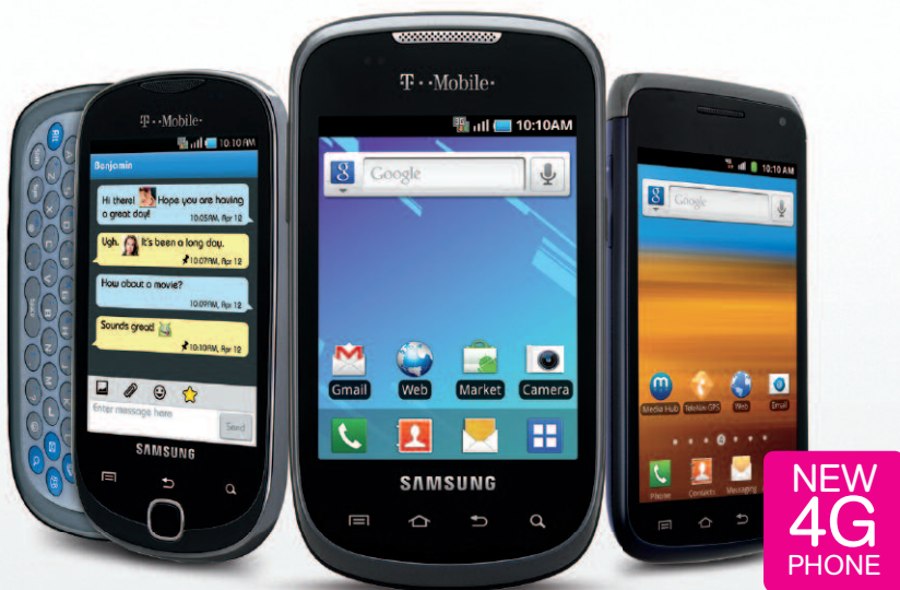
Samsung Gravity® Smart

No Annual Contract Available on any phone in the store. Smartphones starting at $99 99 .