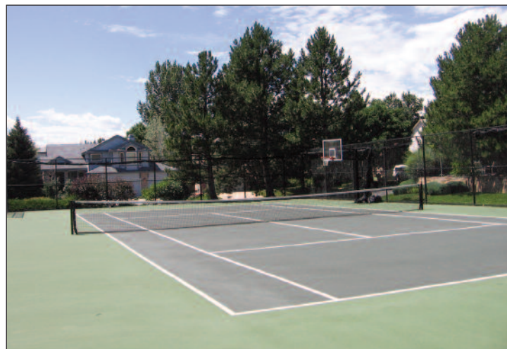
The tennis courts received new locks and are ready for play.

NEXT BOARD MEETING THIRD WEDNESDAY • SEP. 21ST • 7 P.M. AT THE CLUBHOUSE